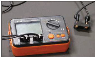
Milli-ohm meter with four point Kelvin probe surface resistivity configuration