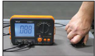
Apply pressure until reading stabilizes. The jig can be rotated in plane to check for directionality