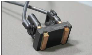
Surface Resistivity Jig (SRJ1)