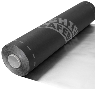
YSHIELD® SAFEBUILD® U230