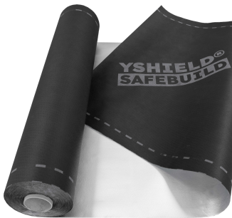
YSHIELD® SAFEBUILD® U230